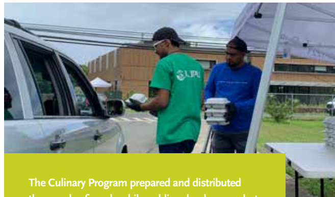
The Culinary Program prepared and distributed thousands of meals while public schools were shut down during the pandemic.

organizations like Kupu that could repurpose it for people in need; Prince Waikiki Hotel opened their cold food storage doors to Kupu providing thousands of pounds of ingredients; Ham Produce and Seafood gave large food donations; and Hawaii Farm Bureau coordinated the purchase and delivery of approximately $40,000 of local produce that was used in the meals.